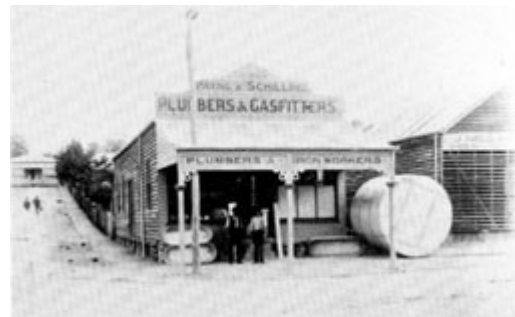
A plumber's shop in Ipswich with water tanks for sale.

Surveyor Henry Wade drew up the first plans for the Ipswich township in 1842 and marked a proposed reservoir to provide a town water supply. The site was a gully running along Gordon Street and Marsden Parade. The gully filled with water when it rained and Wade suggested that a small wall could be built across it to form a dam. However, although residents later requested that the scheme be carried out, the dam was never built.