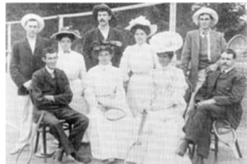
Tennis group about 1915. Did the women really play tennis in those dresses and hats?

About 1865, for example, people interested in cultural activities could listen to the town's orchestra, visit the town library, attend Shakespearian plays and concerts and see a wide range of visiting entertainers including acrobats and singers.