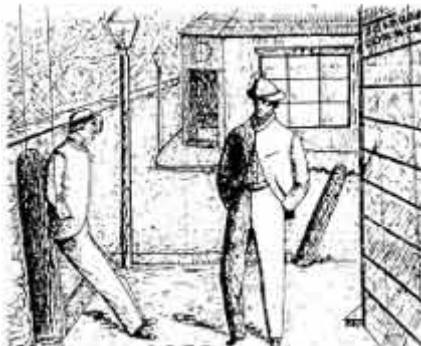
Two 'Loafers' on the corner of Brisbane & Nicholas Streets in the 1860s

Many animals could be seen in the streets of Ipswich. Horses were probably the most common, either being ridden or pulling carts and sulky. There were also many teams of bullocks, which were used to pull heavy loads, usually on two-wheel wagons.