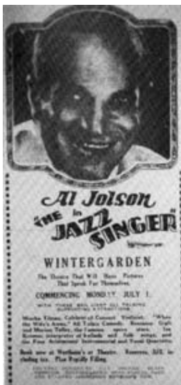
Advertisement for the first talking film seen in Ipswich, July 1929

In July 1929, the first talking film or 'talkie' was shown in Ipswich. The film was 'The Jazz Singer' starring Al Jolson.